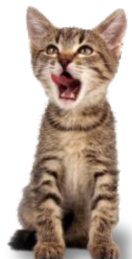
Kittens take to raw food like ducks to water.