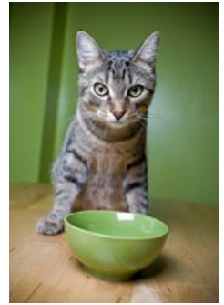
The first step is to stop free-feeding dry food.