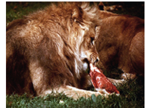
The only difference is size. Your cat has the same nutritional needs as a big cat.

Many different kinds of meat can be used in raw diets. In fact, you should vary the kinds of meat you feed, not only for variety, but also to be sure your cat gets a balanced diet. Chicken, turkey, rabbit, lamb, beef, and many other kinds of meat are available in commercial raw food products.